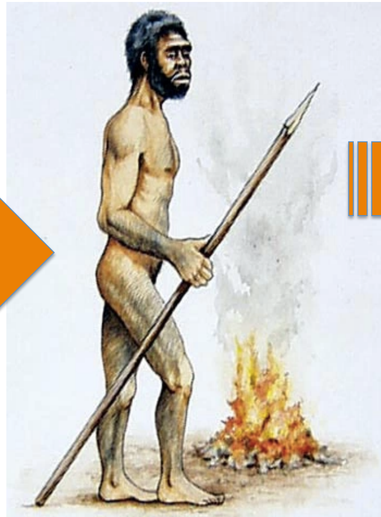
Introduction of fire as a cooking method