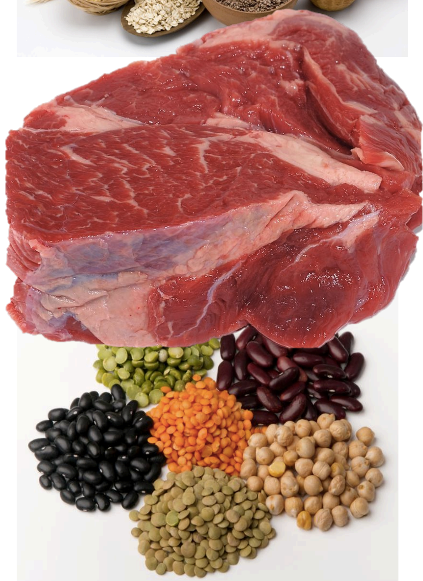
Pulses, meat and grains