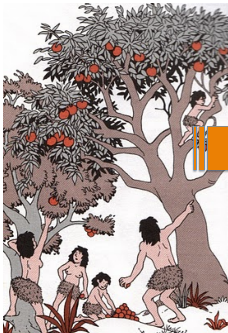
Human first as gatherer

The use of fire by Homo Erectus was a transformative step in the history of man's relationship with food; cooking food not only meant easier digestion but the incorporation of previously indigestible foods into the diet; and as well as improving the appearance, taste and storage life of food , the parasites it contained were eliminated